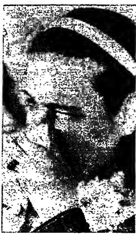
"The child sneezed seven times, and the child opened his eyes."

Indeed, in one episode in the Bible, it was associated with a return to life, when the prophet Elisha revived the Shunammite's son.